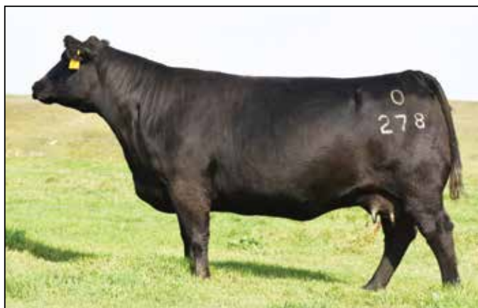
S Blossom 0278 – Dam of S Cornerstone 607