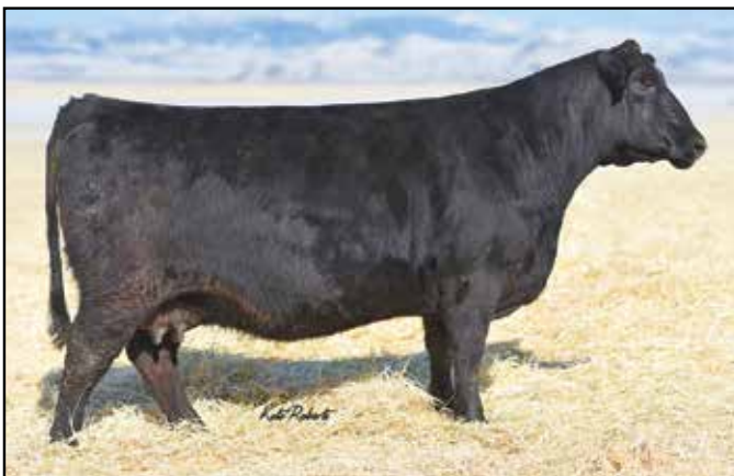
HA Blackcap Lady 1602 – Dam of HA Cowboy Up 5405

Calving Ease: Dam's Production: 3@108 If you're looking to put pounds on, look here. A Montana Cowboy son that checks all the boxes.