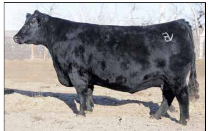
JMB Emulota 013 – Dam of JMB Traction 292

A smooth-made, well-balanced son of Traction that should work on heifers. High IMF.