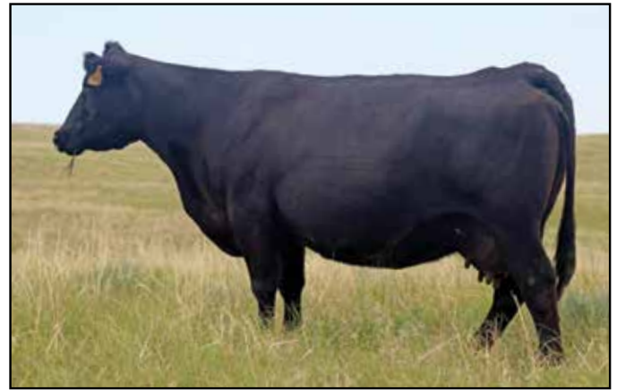
Marcys Treasure 227 – Dam of Marcys Scale Breaker N Plus She is an ET donor at M Diamond Angus.