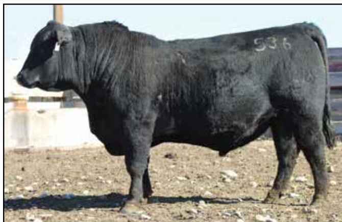
Marcys Cedar Ridge 536 – Sire of Lots 86, 87, 88 &amp; 96 in this sale. His females have tremendous udders.