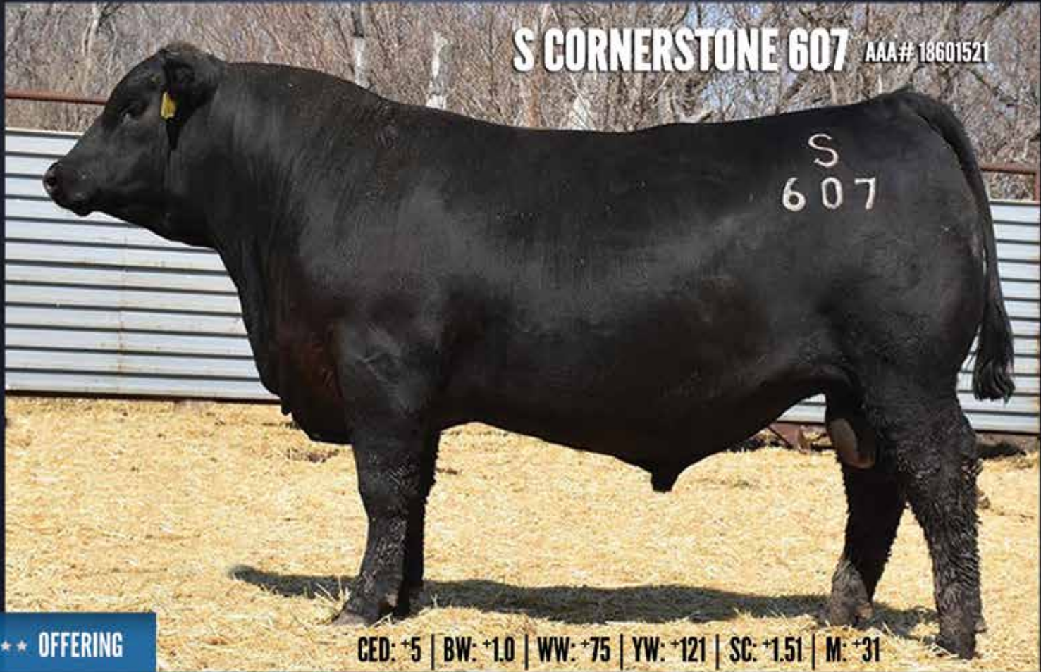
S CORNERSTONE 607 AAA# 18601521