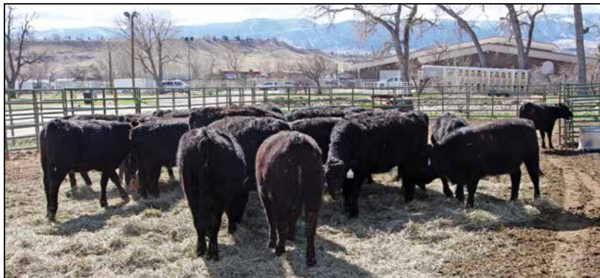
Lisco Angus commercial heifer calves.