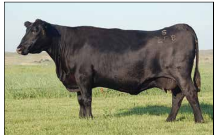
S Queen Essa 208 – Dam of S Steamboat 3110

Calving Ease: Dam's Production: 7@96 A high IMF Steamboat that is very well made.